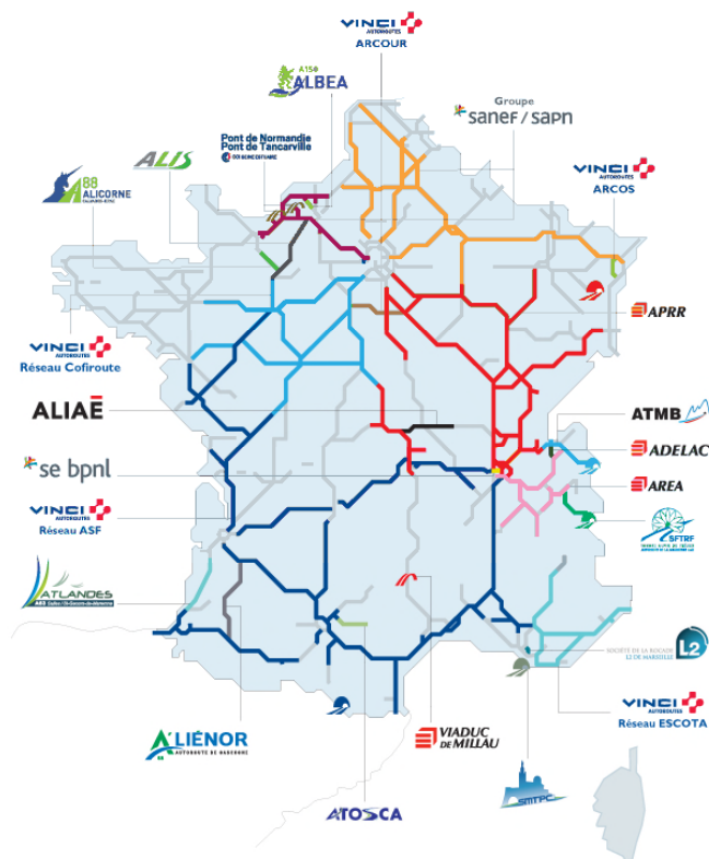
Les sociétés concessionnaires d'autoroutes et d'ouvrages à péage