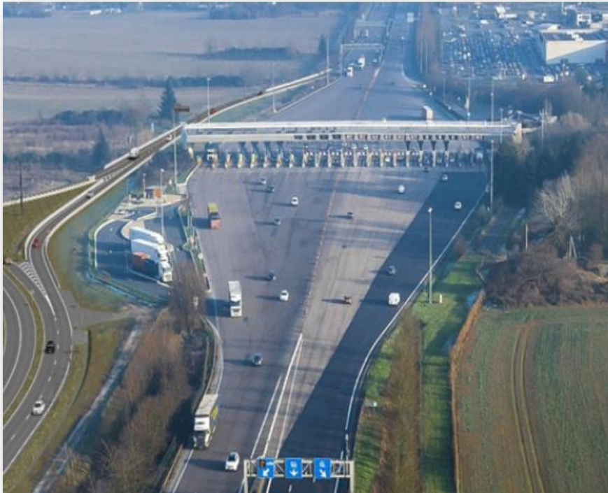
Current situation at the Buchelay toll barrier