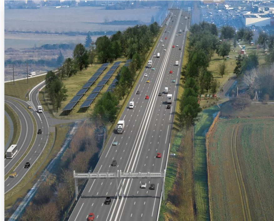
After switching to free flow